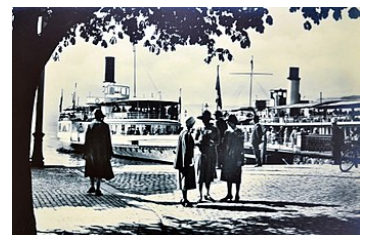
ZSG steamships Stadt Rapperswil and Stadt Zürich at Bürkliplatz respectively Bürkliterrasse .