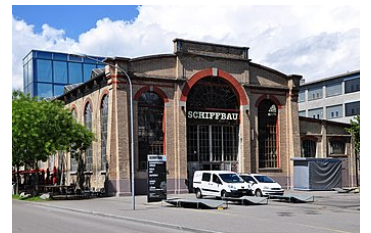
Escher Wyss's former Schiffbau or shipbuilding hall in Zürich now functions as a cultural centre.