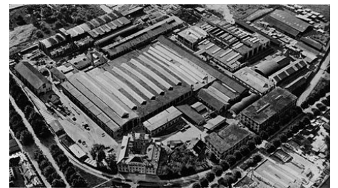
The Escher Wyss plant in Zürich in 1930